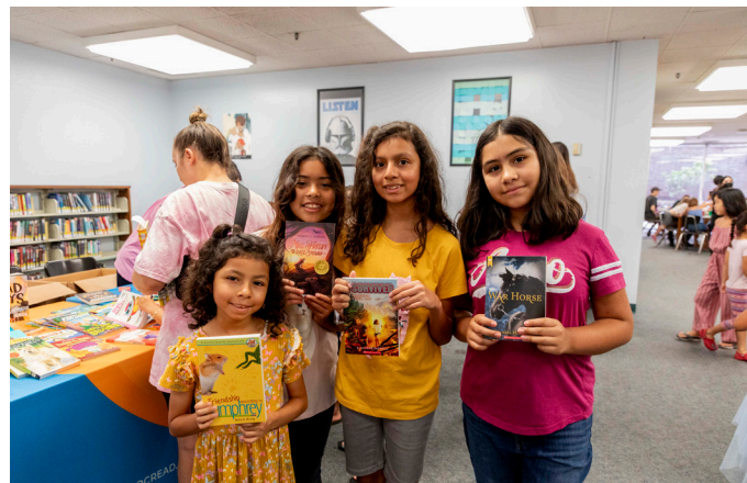
Homework Help: Students receive assistance with math, reading, writing, science and social studies homework through OCPL's free online tutoring and in-person homework programs.