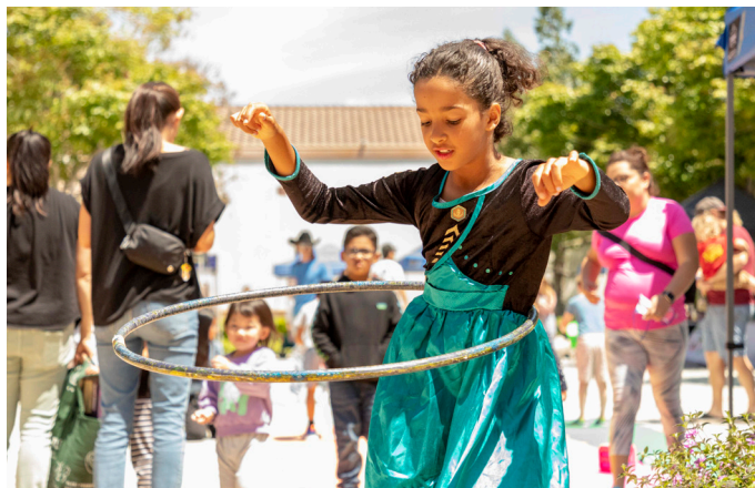
After-school Programs: After-school programs give children a place to spend time with their peers and engage in interactive, enriching programs like book clubs, crafts, STEAM and a variety of other fun activities.