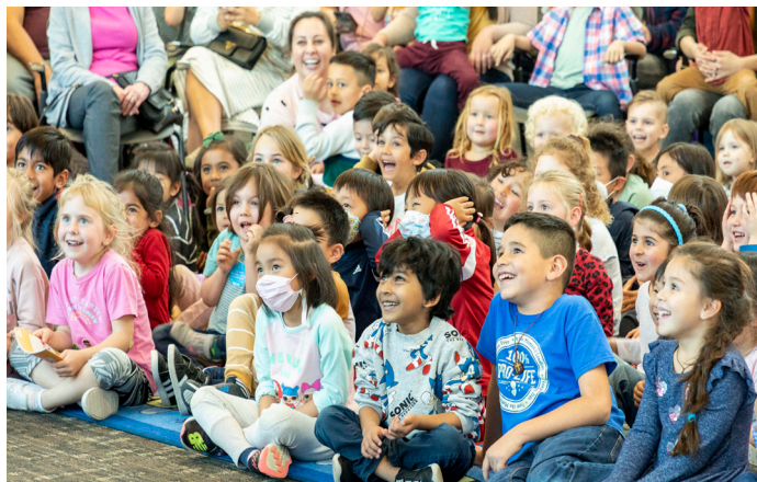
Storytime: Fosters early literacy by introducing the magic of books and nurturing a love for reading. It also creates a space where families come together, strengthening social bonds and instilling a sense of community from an early age.