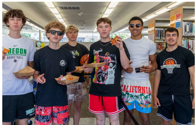
Teen Advisory Boards and Teen Volunteer Programs: Helps teens develop responsibility, including leadership, critical thinking and collaboration skills, in a space of their own.