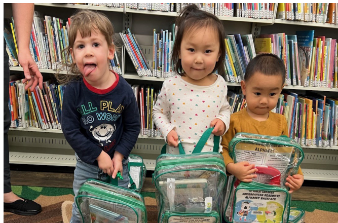
Themed Backpacks and Kits: A curated collection of materials and resources in one, easy to carry, easy to borrow backpacks. Topics include Mental Health, Kindergarten Readiness, Binge-Ready authors, Hiking, and Book Club kits.