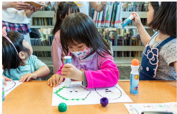
Grab-and-Go Craft Kits and Videos: Grab-and-go craft kits boost cognitive skills, foster creativity, help children develop fine motor skills, and enhance literacy.