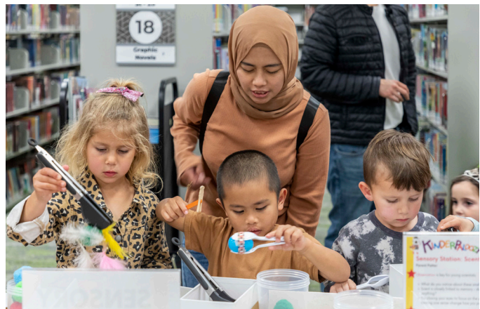
Kinderpalooza: Demonstrates essential skills needed for children to thrive in Kindergarten, while delivering a fun, family experience. Community partners enhanced the event by providing resources.