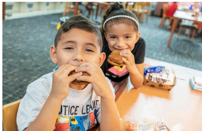
Lunch at the Library: During the summer, meals were provided to support health and wellness, while enabling learning, and connecting families to essential resources and services.